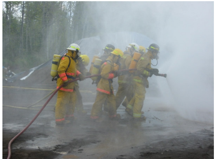
The team at a training session

The new pumper is rapid with guaranteed responses. It is a strong, reliable vehicle with improved firefighting capacity. It will enable the fire department to respond to all manner of incidents within the township and to our neighbouring mutual aid partners. It is the most powerful emergency vehicle the township has ever owned and is capable of climbing the Mile Hill in a fast and safe manner.