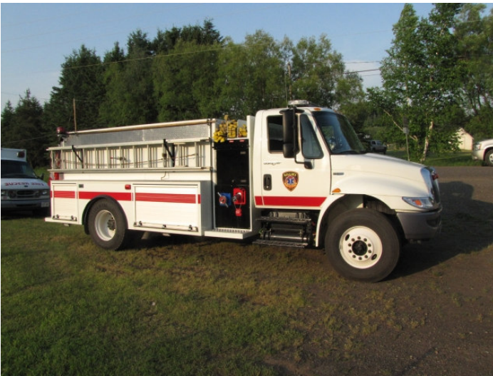
The new fire pumper

Due to the old 1982 fire pumper no longer meeting insurance requirements and the standards of the Ontario Fire Marshall (OFM), a decision was made by Council in 2010 to purchase a new pumper that would better serve the community. After issuing a tender, the successful company was Holland Enterprises located in Conmee Township. The pumper was custom built to meet the specifications of the OFM, the needs of the team, and to fit into the fire hall.